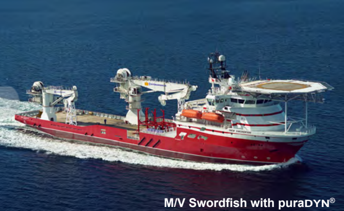
on CAT 3516s