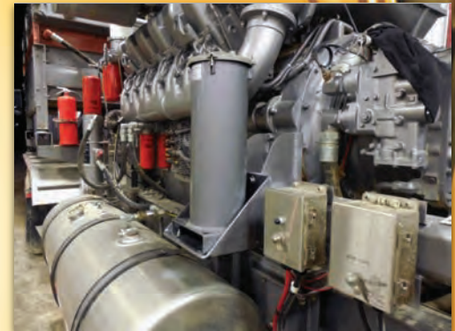
Frac Truck equipped with puraDYN ®