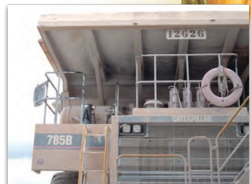
Cat 785B Haul Truck equipped with puraDYN ®