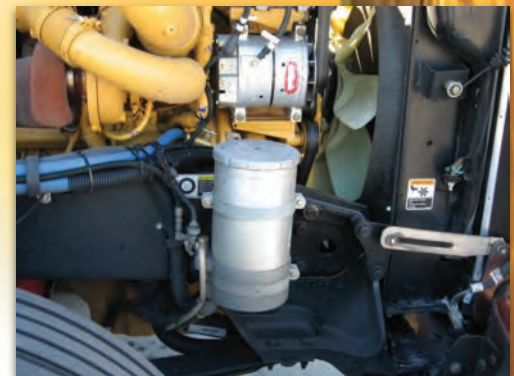
Caterpillar Engine equipped with puraDYN ®